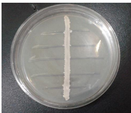
Fig. 1. A cross Streak plate of Bacillus sp. shown to have antimicrobial activity against Escherichia coli (clinical isolate).

One of the culture belonged to Bacillus sp. showed high antimicrobial activity against Escherichia coli (Fig. 1) while other culture which was identified as E. coli from our collected isolates shown antimicrobial activity against Corynebacterium pseudodiphtheriae , Pseudomonas vulgaris and Staphylococcus aureus . (Fig. 2).