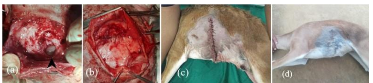
Fig.3. Surgical procedure and follow up of deer.