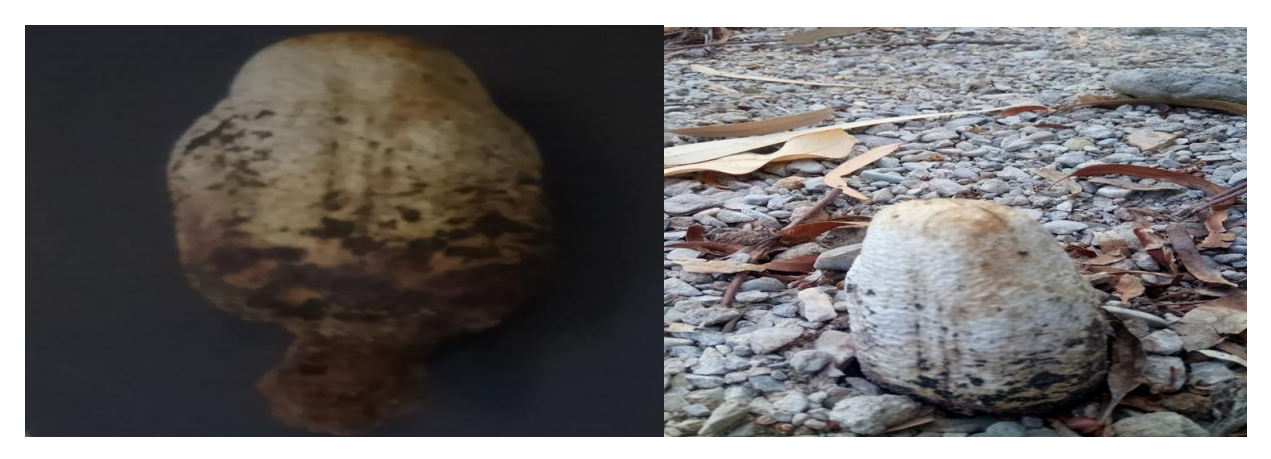
Fig.2. and Fig.3. Fruiting body (basidiocarp) of Pisolithustinctoriusat young (right) and mature (Left) stages of their life cycle respectively.