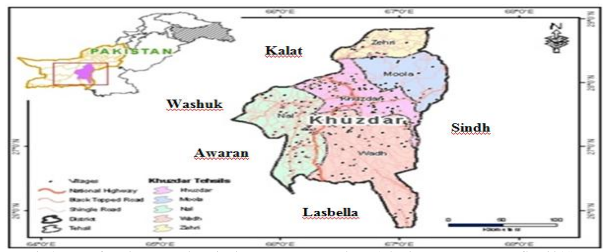
Fig.1. Map of Pakistan showing district Khuzdar Balochistan (District development profile, 2011)