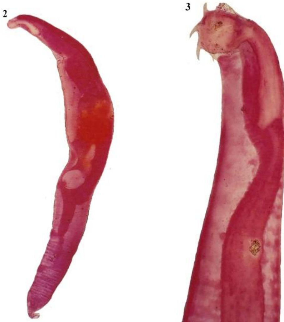
Fig. 2: Photomicrograph showing entire male.